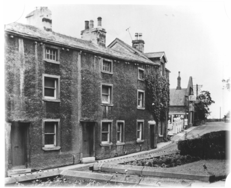
Duke Street, Settle looking towards the institute site.